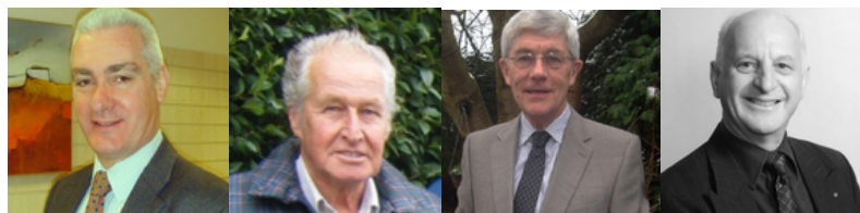
▲ YOUR LISTENING TEAM FOR DESBOROUGH:

We will continue to work on your behalf to improve our local streets for the benefit of motorists, pedestrians and cyclists.