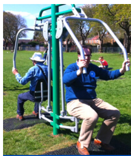
▲ The outdoor gym

We are delighted to have been able to deliver numerous improvements to our local leisure facilities over the years, for the benefit and wellbeing of Desborough's residents.