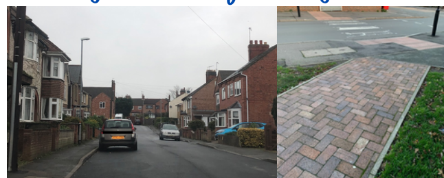
▲ Photo: The new block paving and Princes Avenue - transformed.