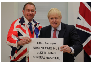
▲ Photo: Prime Minister Boris Johnson with Kettering's MP Philip Hollobone

HM Government has substantially strengthened KGH's finances with a complete write-off of the Trust's £167m debt.