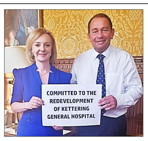
Rt. Hon. Rishi Sunak MP