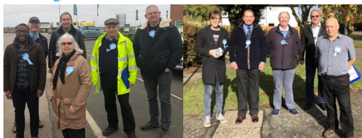
▲ PHOTO: Some of your local Listening Team, out and about in Wicksteed Ward recently. Speaking to residents and listening to their concerns.

*Telephone 01536 512007 to request a paper copy of our Local Issues Survey. YOUR LOCAL CONSERVATIVES: WORKING FOR THE COMMUNITY