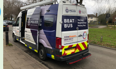
Working in partnership with Northants Police to keep our community safe. CCTV at the Grange shops delivered along with regular visits from the "Beat Bus".