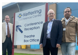
▲ Photo: Positive and decisive action by local Conservatives, working together with the community, helped to save this important facility.

We are delighted to report that the Lighthouse Theatre, Arena Sports Centre and Balance Health Club will now remain open, thanks to positive and effective action by Conservative-led NNC. We would particularly like to recognise the efforts of the KLV Support Group who came together following the threat of closure.