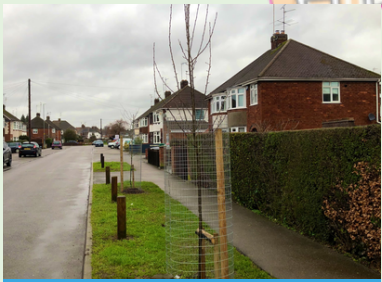
Tree planting secured!