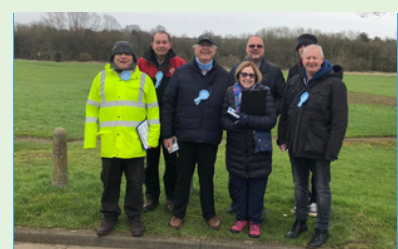
Not just here at election time! Local Conservatives have been canvassing across the Constituency recently, visiting residents and listening to their concerns.