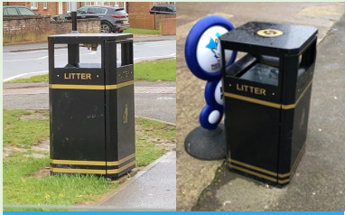
New litter bins secured at Windmill Avenue shops and outside KBA.