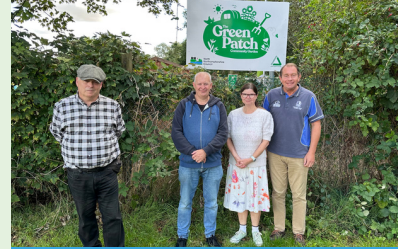
The Green Patch has been safeguarded for the future!