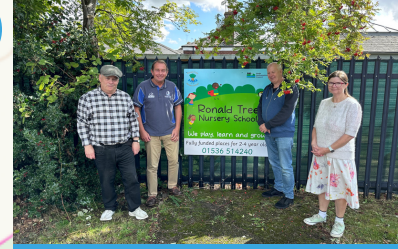
Supporting Ronald Tree Nursery with £100,000 payment and delivered an increased Maintained Nursery Supplement.