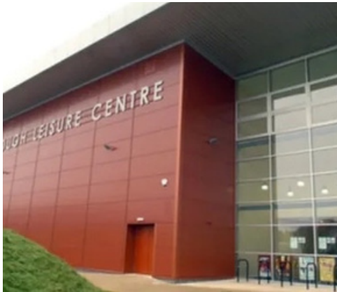
▲ Photo: One of the places that will benefit from new S106 funding.

We are delighted to report that after much hard work on your behalf, we have been working proactively with local developers and officers at North Northamptonshire Council to secure approximately £2 million of S106 funding for the benefit of Desborough released through new developments in the town. In addition, separate to this there is a further £1.5 million of S106 allocated for improvements to Desborough Leisure Centre.