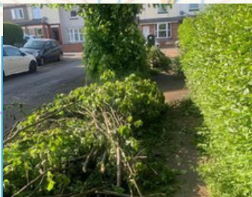
Improving management of the Council's trees across the ward.