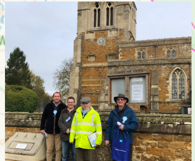
Not just here at election time! Local Conservatives have been canvassing across the area recently, visiting residents and listening to their concerns.