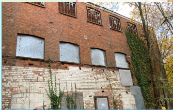
A solution has been found for the Lawrence's Factory site and a new development is on the way.