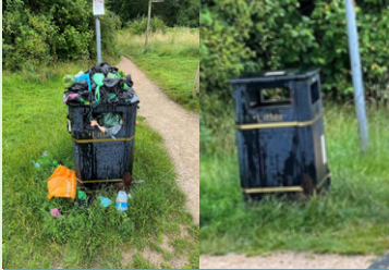
Working hard to keep the ward clean and tidy for all.