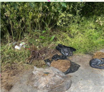
Tackling flytipping across the ward.