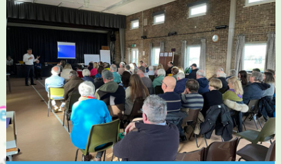
Ward surgery meeting and supporting Wilbarston's Neighbourhood Plan meeting.